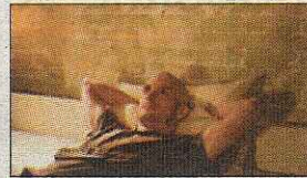
Elijah Wood sheds his hobbit looks in "Day Zero."

Winner of multiple Cesar-Awards — the French equivalent to the Oscars — this adaptation of "John Thomas and Lady Jane" brings D.H. Lawrence's story of reawakened desire to the big screen. The story is one of the three versions that's been printed of Lawrence's "Lady Chatterley's Lover."