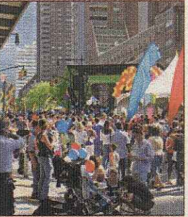
Bring the family to the Tribeca Street Fair.

An array of activities and performances unfold over seven blocks in the heart of Tribeca as local schools,