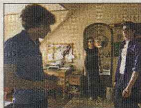
"The Education of Charlie Banks"

Jesse Eisenberg starred in one of the festival's original claims to fame — "Rodger Dodger," back in 2002. Now he returns as