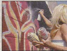
"Bomb It" is an exploration of graffiti culture.