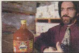
Billy Mitchell in "The King of Kong."

Everyone loves a competitive world of [fill in the blank]. In this case, it's "Donkey Kong." Though versions of the classic arcade game are instantly accessible via a quick Google search, there is in fact a world record-holder. And apparently he's very protective of his title.