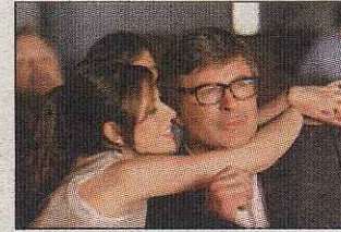
Sarah Michelle Gellar and Alec Baldwin star in "Suburban Girl"

A three-pronged story about, well, love. Set in Puerto Rico, "Lovesickness" follows its ensemble of characters through a love triangle, a failing marriage fraught with infidelity and a hostage situation.