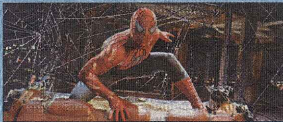
Spider-Man is taking over the city for a third time.

you and receiving a free Spider-Man comic book, among others. No purchase necessary. To find a participating comic book retailer near you, call 1-888-COMIC-BOOK.